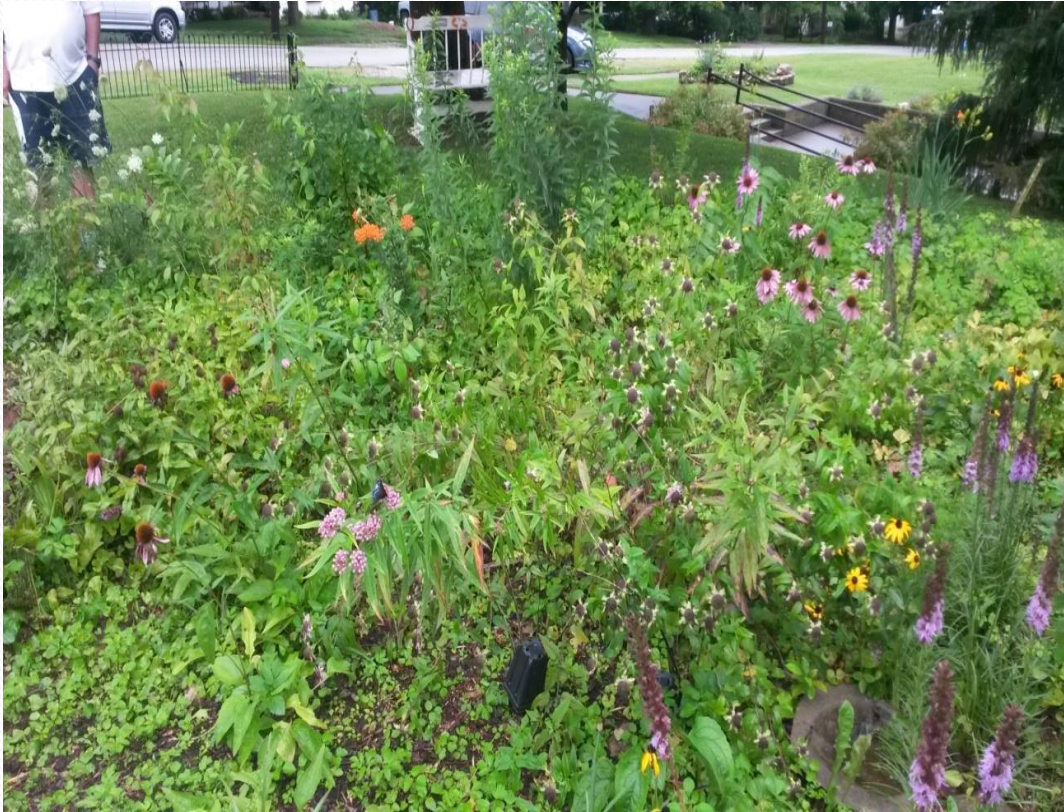
Mature Rain Garden