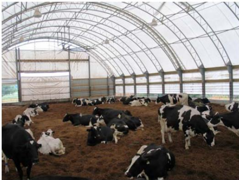
University of Minnesota Extension